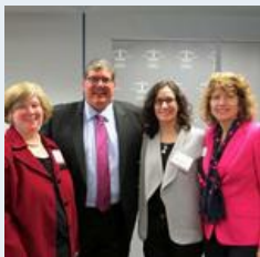
Solo & Small Firm Practice