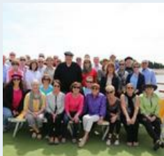
ISBA President's Trip 2015