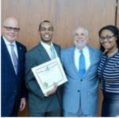
2nd District Admission Ceremony, May 2015