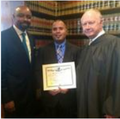
3rd District Admission Ceremony, May 2015